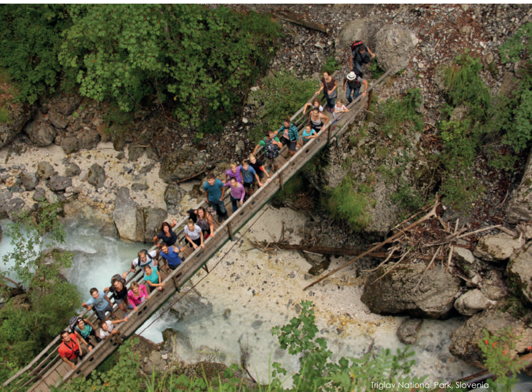
Triglav National Park, Slovenia

The application procedure is based on submission of documents (application form plus supporting materials, a full CV, a letter of motivation and two reference letters) and a subsequent oral interview (personal, skype).